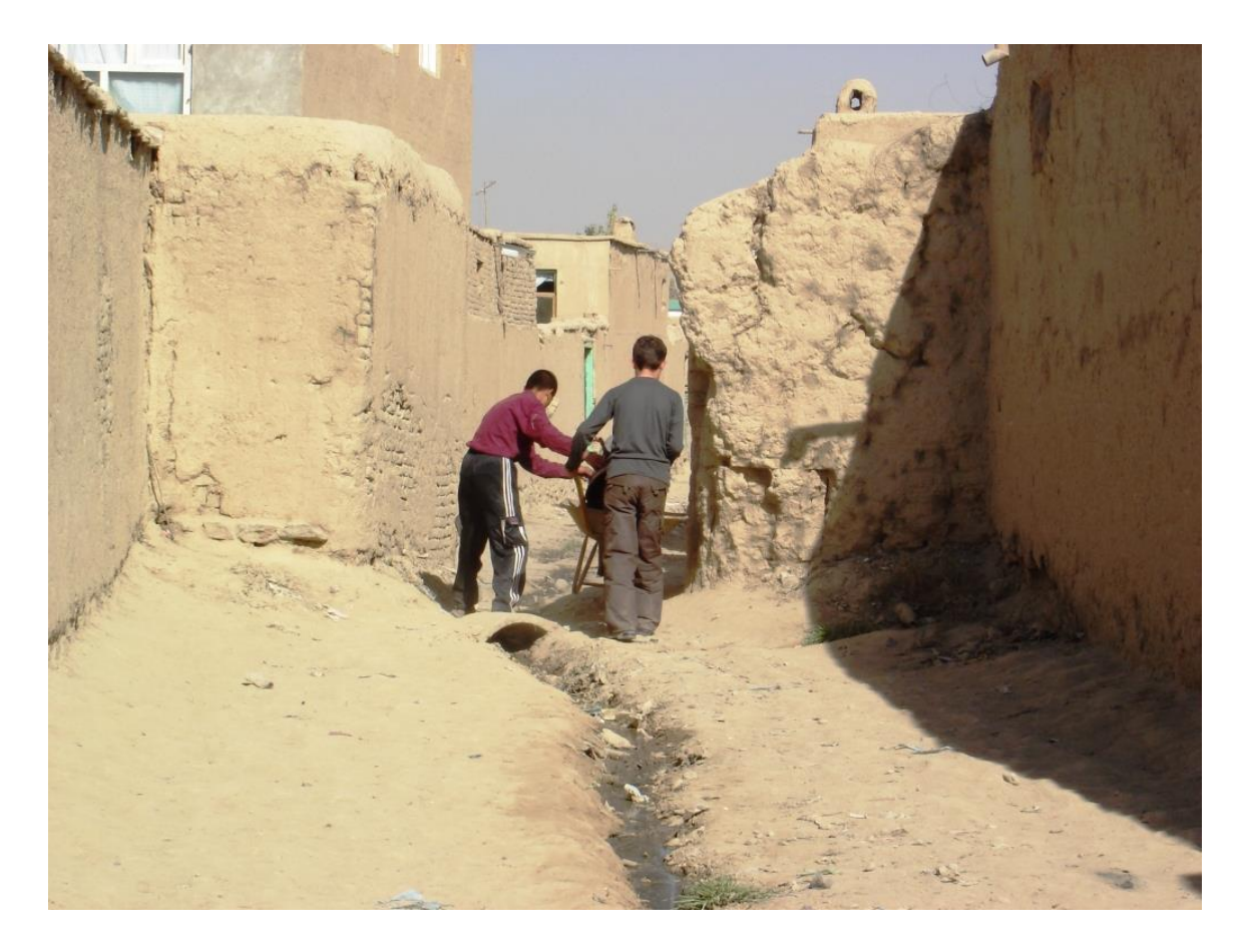
Figure 3 shows the same street after the main upgrading, with the community portion yet to be paved. The width of the street is now sufficient for a vehicle to pass.